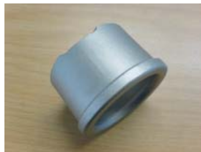
Aluminium end casting.