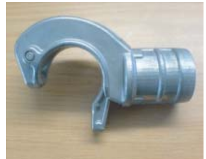
2" brace claw casting.