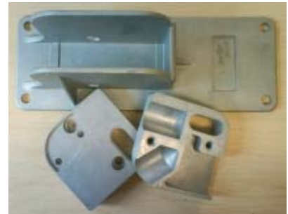
Castings used in the production of dissable aids.