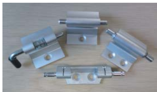
Aluminium cast and extruded door hinges used by Rittal CSM and Corp, all steel components are amnufactured in house as well as the final assembly.