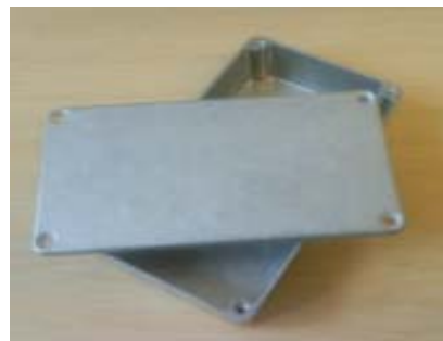
Aluminium pressure die cast enclosure boxes.