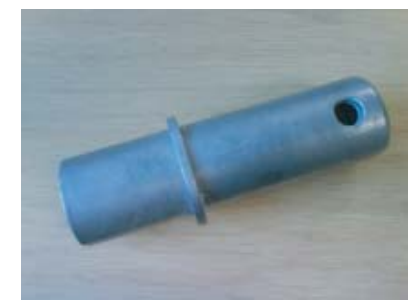
Die cast Aluminium spigot used in the aluminium tower industry to connect two extention frames together.