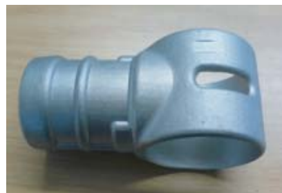
Pressure die cast T joint with a nominal wall thickness of 4mm