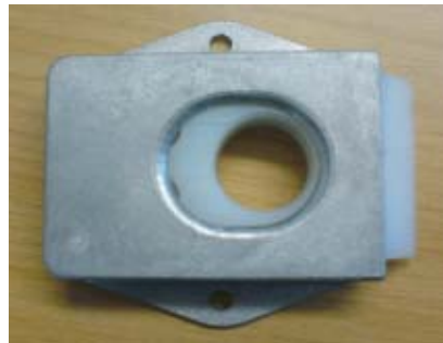
Aluminium die cast housing with a nylon catch used to secure trapdoor platforms.