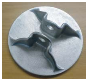
Gravity die cast foot plate, with recessed under section to suit non slip rubber pad.