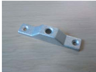
Aluminium cast locating block used to secure single door on server cabinets