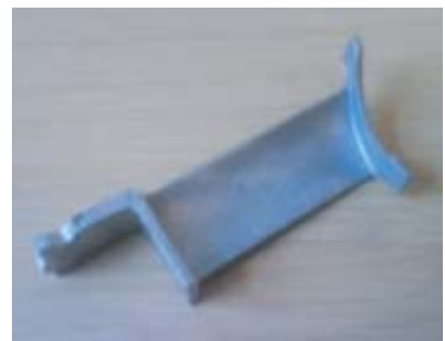
Aluminium pressure die cast fan blade produced for Rolls Royce. Total weight of product is 10 grams.