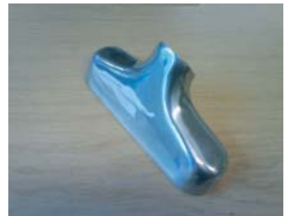
Highly polished Aluminium cast nozzle used by many high steet stores to steam and remove creases on silk fabrics, clothing curtains and wedding dresses.