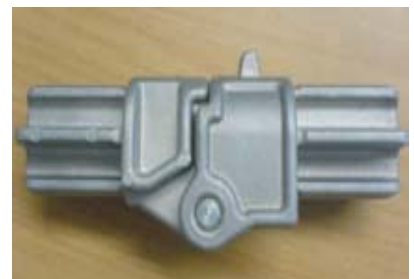
Elbow locking joint