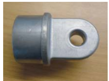
High pressure die cast pivot plug using LM6 for weldability