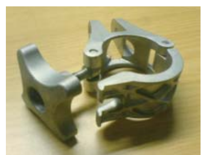
High pressure die cast clamp assembly, mainly used on outriggers for aluminium scaffold systems.